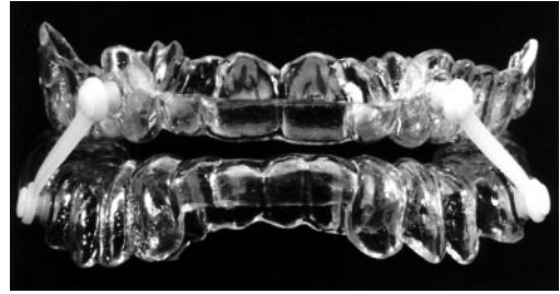
Figure 2 Modified Silensor appliance.

adjustment. The buccal connectors are available in four lengths and the mandible may be readily advanced by replacing the original connector by a shorter one. Since modification of the splint design could have had an effect on outcome, results for the two types of splint were compared both separately and for the group as a whole.